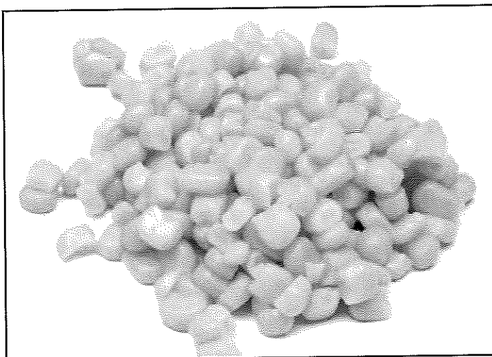
Cut Yellow Corn